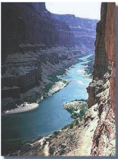
The Grand Canyon!

I don't make it. I thought "lava" was what came out of volcanoes; ammo cans carried ammunition; groover was some hillbilly's dog; Winston was a cigarette. I'm much smarter now, though I haven't figured out what to do with all this new found knowledge.