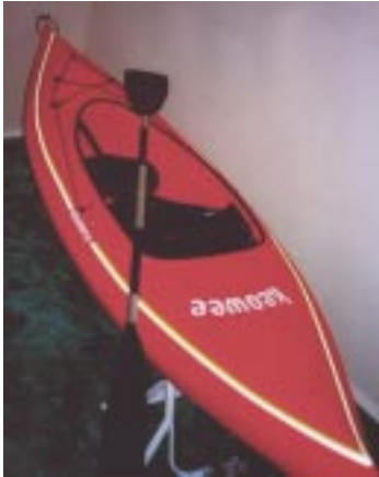
Online Current News Readers: Click on image to see kayak specs.